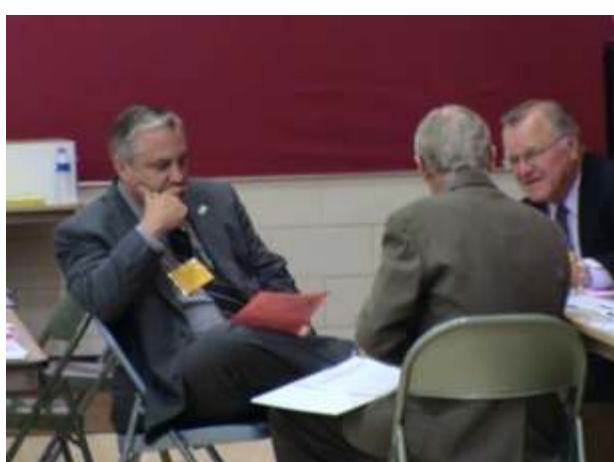
The Tuesday session ended with a Bible Study: "Christ's Love, Our Calling-- Time with God"