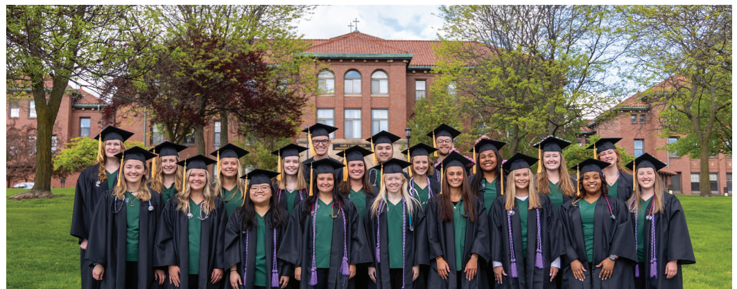
The Class of 2024 was comprised of students from 17 states representing 39 academic programs. Top majors included nursing (pictured), biology, sport and exercise science, sports management, education, marketing, and criminal justice.